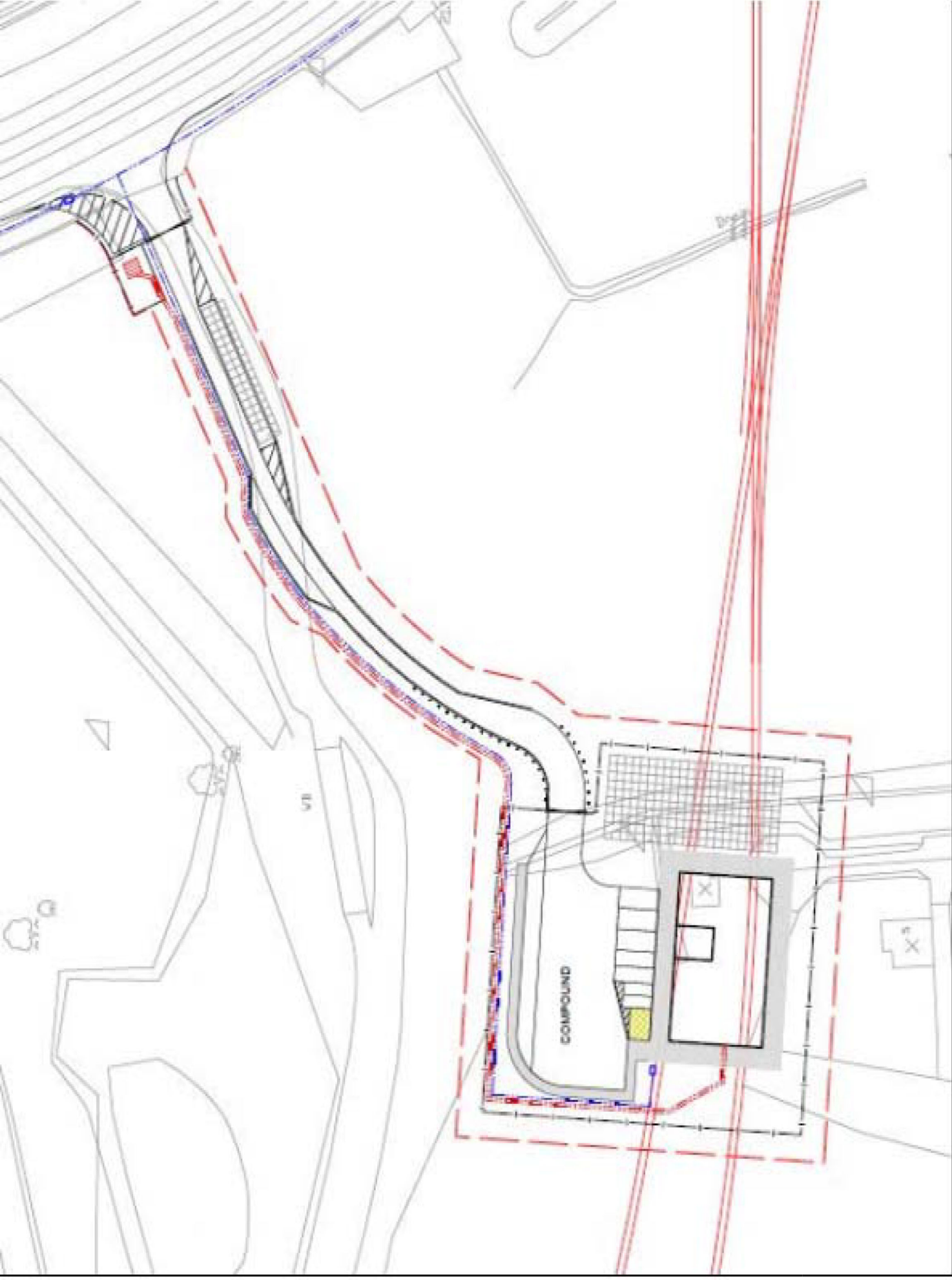
Figure 7: Proposed permanent vehicular access to shaft 4 and access building